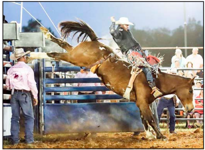
The Southern Rodeo Company will be bringing the Hiwassee Pro Rodeo to the Georgia Mountain Fairgrounds June 26-27.

The rodeo was originally scheduled to take place in May before having to be pushed back because of the virus, though