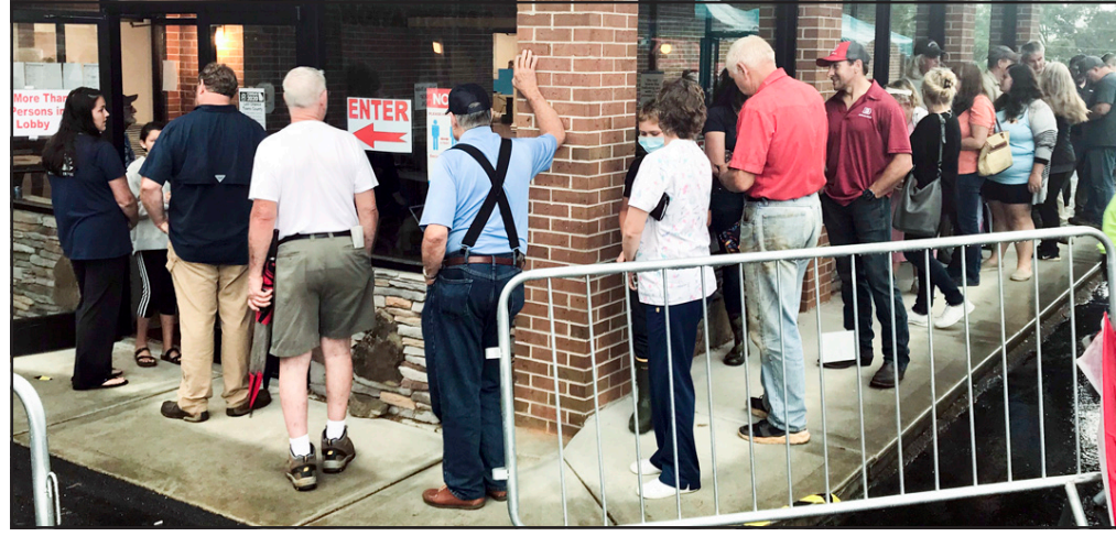
Security officials stopped new line entrants at the Hiwassee Precinct at 7 p.m. on Election Day. This is the line at 7:30 p.m., which makes sense considering all three Towns County precincts voted in Hiwassee June 9, as previously reported.