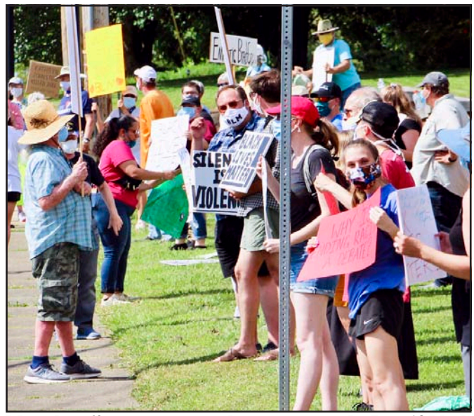
More than 60 protesters turned out to support the June 13 Black Lives Matter solidarity protest in Young Harris.

Specifically, they wanted to give people the option of protesting while social distancing during the COVID-19 pandemic, which they accomplished by holding the event in front of the college