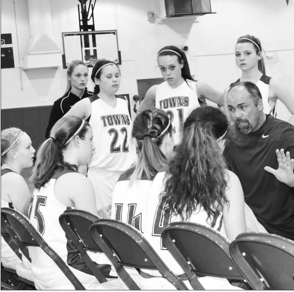
TCMS 2015 Christmas Tournament

"Our press was really effective against them. We just