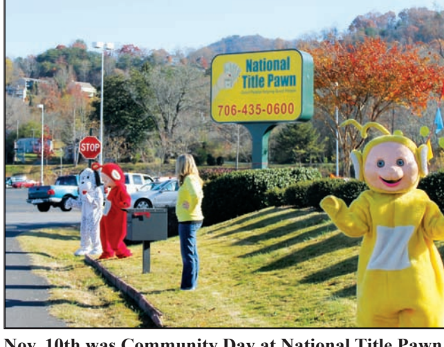
Nov. 10th was Community Day at National Title Pawn.

brought folks from all over the Southeast to show their unique art and craftsmanship with over 65 Juried Artist and Crafters participating.