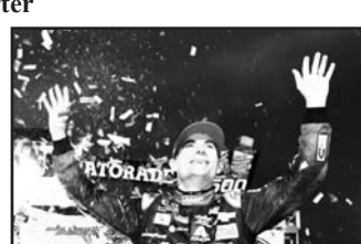
Jeff Gordon Wins at Martinsville.