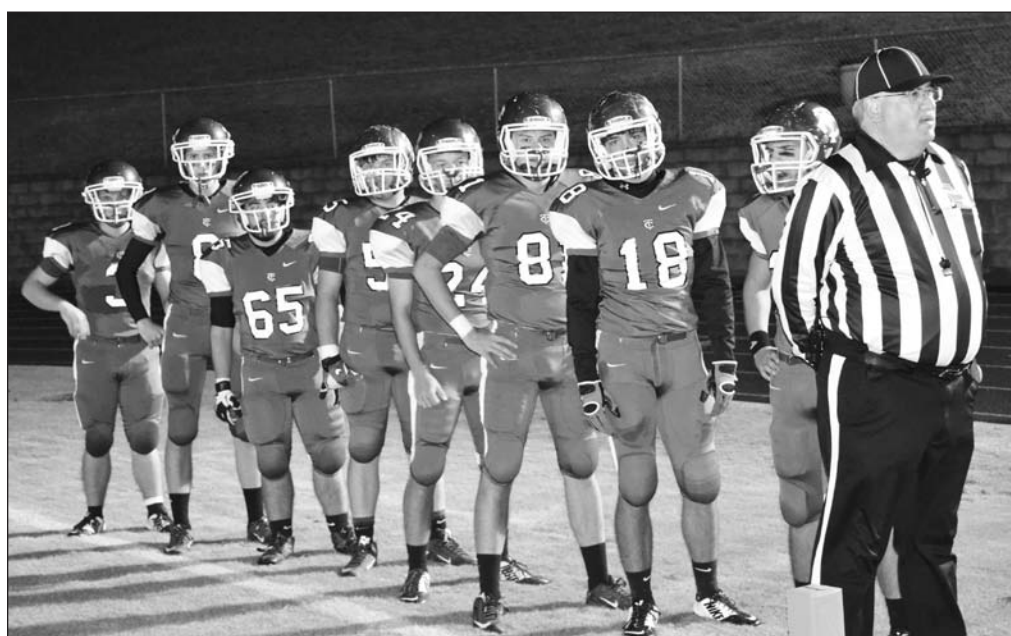
Towns County's seniors serve as team captains for their final game as an Indian.