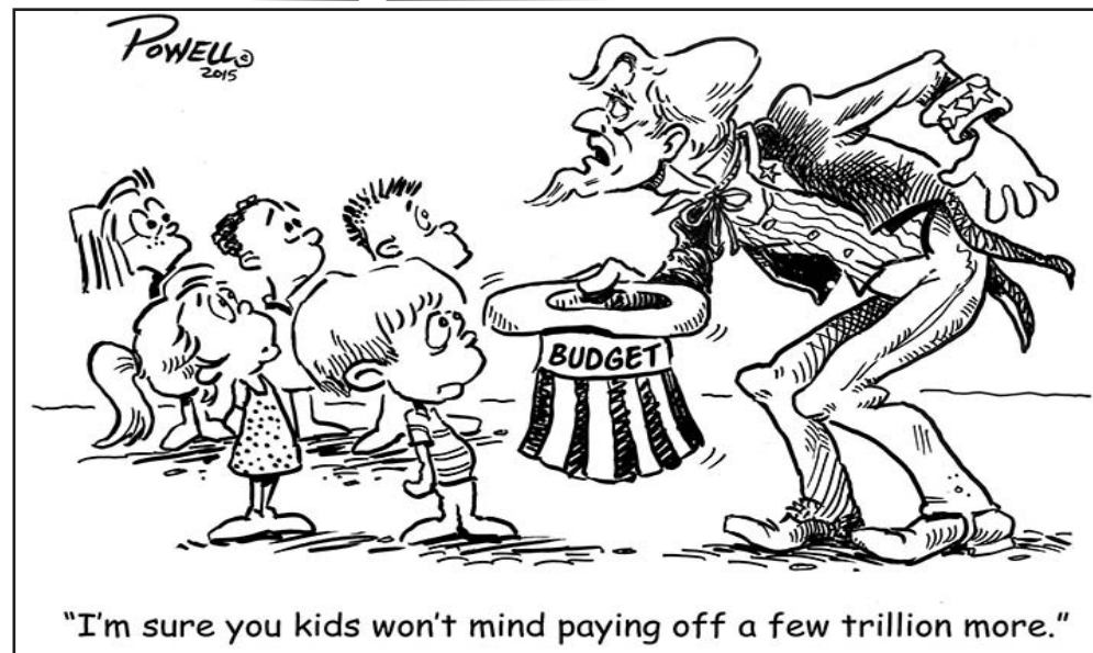
"I'm sure you kids won't mind paying off a few trillion more."