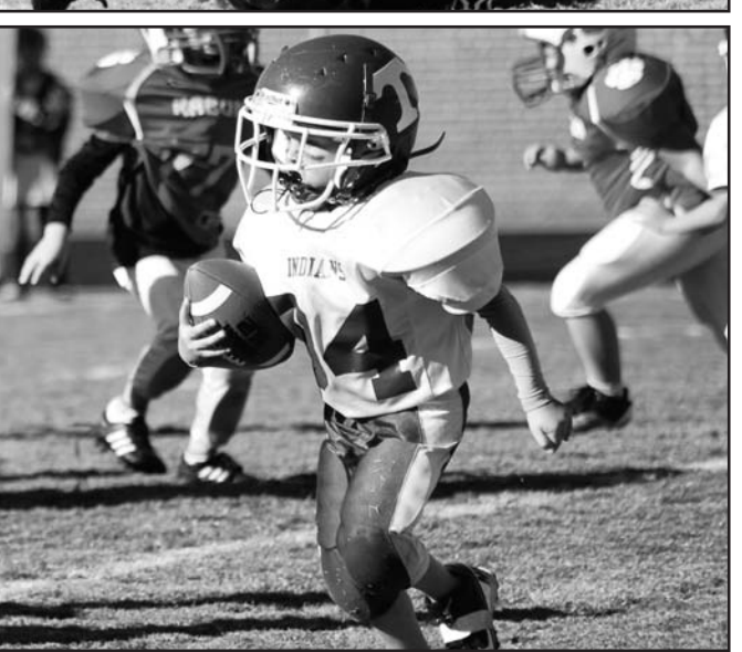
Towns County Youth Football