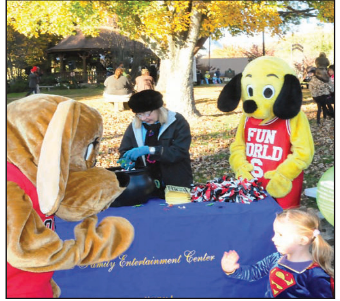
Expect the Funworld mascots to be on hand for Halloween On the Square.

children and we are expecting judging contest. a great turnout.<sup>2</sup>