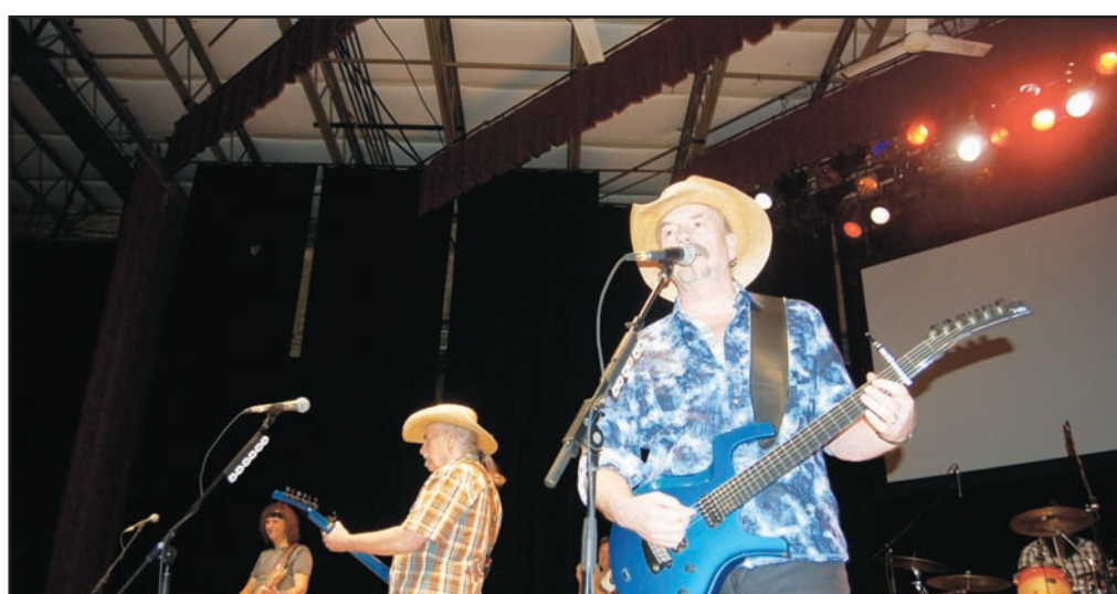
The Bellamy Brothers packed The Hall on Saturday at the Fall Festival.