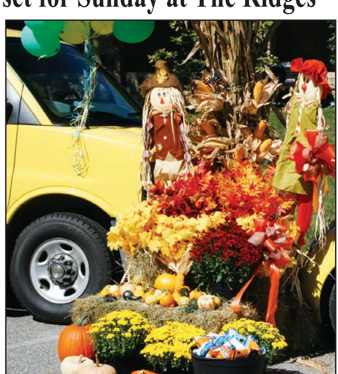
Fall-A-Bratton and Trunk or Treat are back for a 2012 fun for all.

There will be candied apples, hot dogs, and hot cider available for purchase if you start to feel that low rumble in