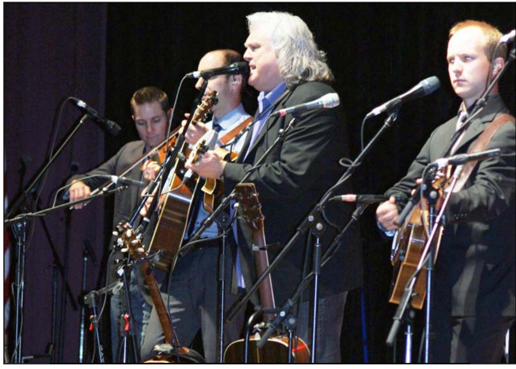
Ricky Skaggs and Kentucky Thunder delight the crowd at Anderson Music Hall on Friday as the Fall Festival got underway at the Georgia Mountain Fairgrounds.