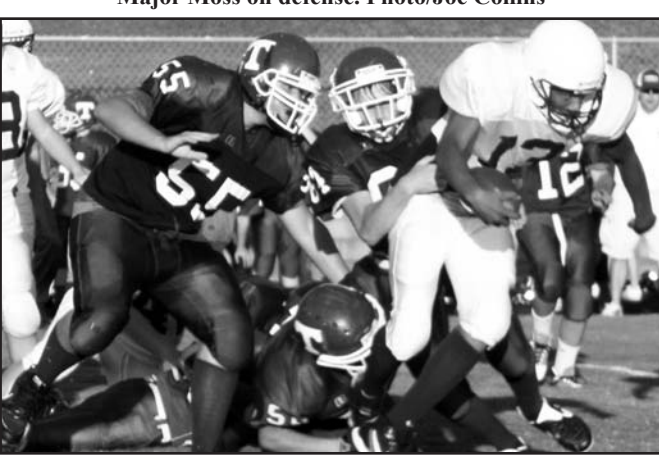
Towns County's defense swarms the Lions.