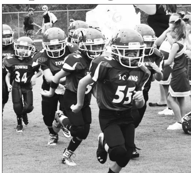
The Indians hit the field with determination.