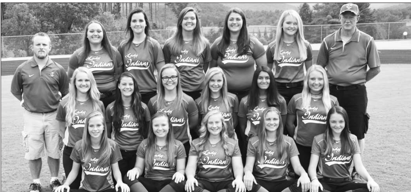
The 2015 Towns County Lady Indians softball team with coaches.

"Hitting, we've amped it up. We've brought in the pitching machines, throwing different balls. Not just your fastballs – we set it up for drop balls, rise balls, really pushing our offense."