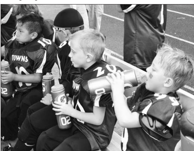
The young Indians take a water break.