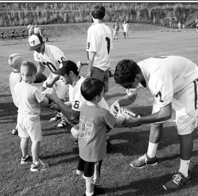
Players and coaches instruct at Towns County's Youth Camp.

hold the football when passing to achieve that perfect "catchable" spiral that so often wins a game during the most crucial time period.