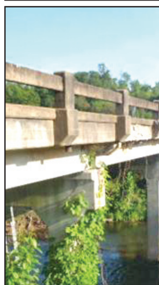
These two bridges on State Route 17/75 were built in 1939.