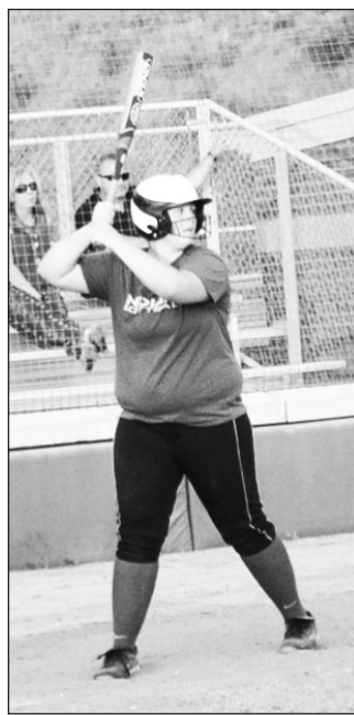
The Towns County Lady Indians softball team was in action at Union County last week. The Lady Indians picked up a pair of wins over Union County and Fannin County's JV squads on Tuesday.