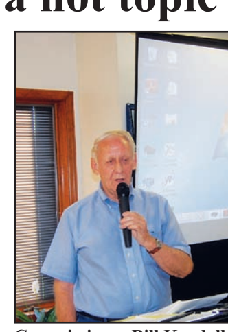
Commissioner Bill Kendall

it," said Kendall. Kendall recapped the exemptions of the bill as well as the tax increases on every day consumer items.