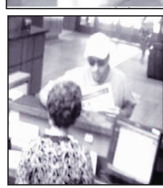
Video surveillance cameras caught these images during Monday's bank robbery at Citizens South Bank in