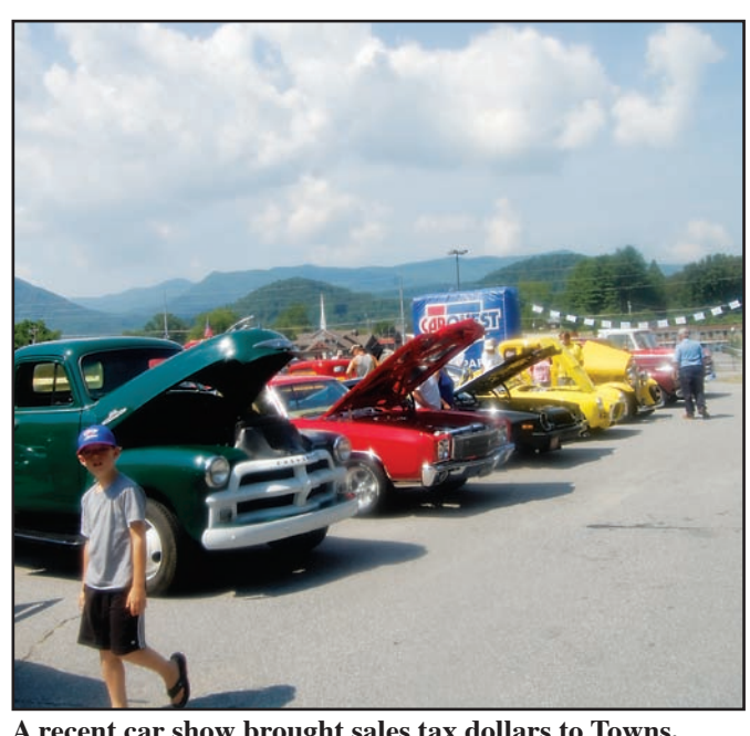
A recent car show brought sales tax dollars to Towns.

group traveled from all across Louisiana, Virginia, Maine, Illinois, Missouri, New York,