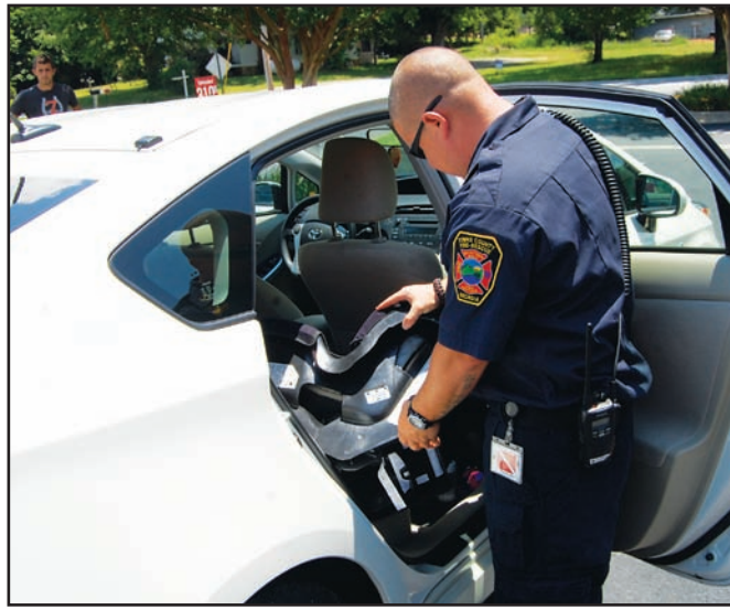
Safe Kids is making a difference in Towns County.

begins at dark. Don't miss out See Child Safety, page 12 on a great holiday tradition.