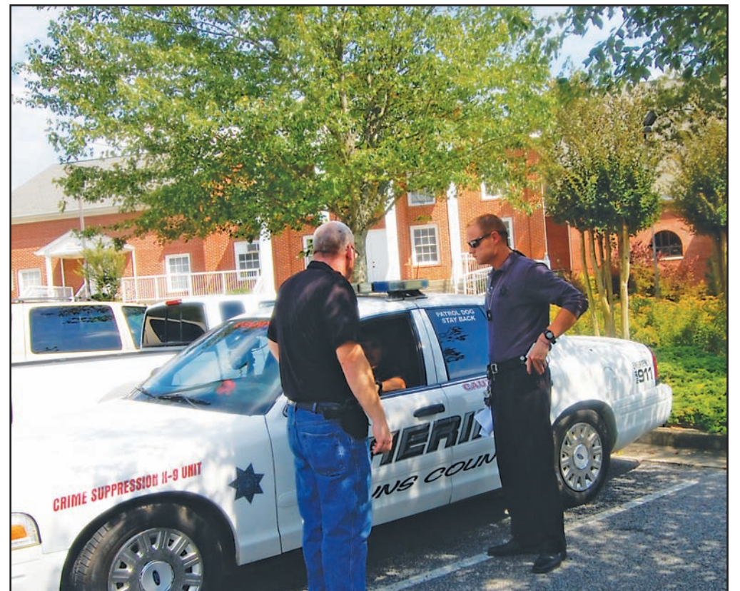
Local and state authorities discuss details about last week's bank robbery at Citizens South Bank. The suspect remained at large at press time.

By Charles Duncan Towns County Herald cduncan.tch@windstream.net