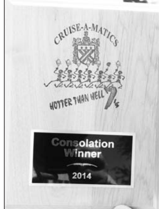
Above: The BRMRFCC's first piece of hardware following the Columbus Tournament. Left: The seven team members who traveled to Columbus last month to take part in the 7's tournament. They are attempting to host their own local tournament sometime later this summer but will be keeping busy in the coming weeks.

Look us up on Facebook or email for more information at brmrugbyclub@gmail.com .