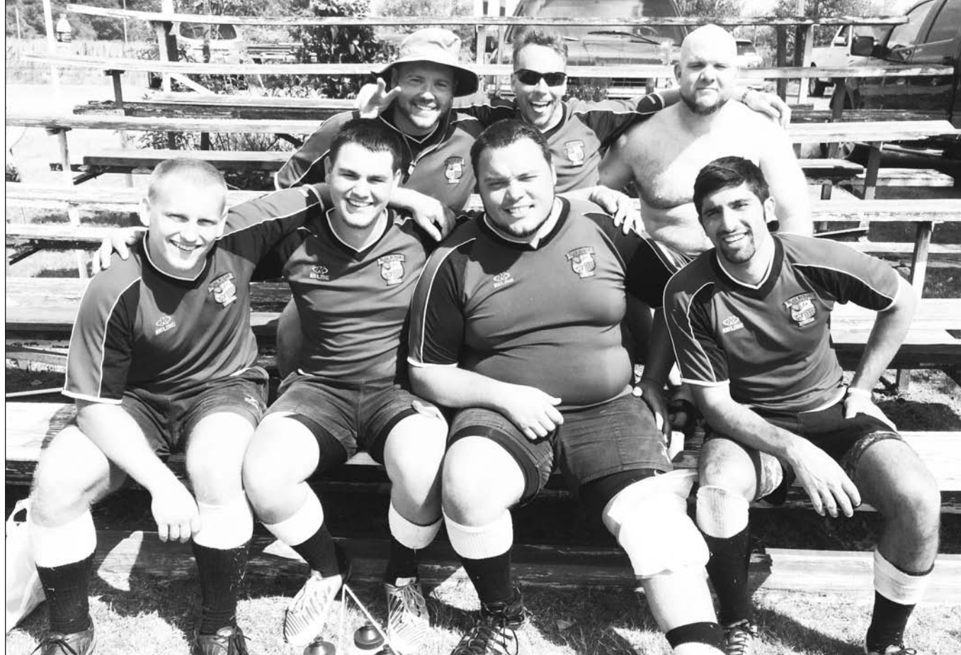
The club has other tournament possibilities going forward in July and is trying to nail down the date to host a

BRMRFCC was one of 10 teams competing, with teams coming from Georgia, Florida, South Carolina, and Alabama. BRMRFCC traveled to Atlanta to play a 15's tourney on June 28 and back to Atlanta for Hotlanta 7's tournament on July 12th.