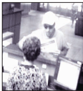
Video surveillance cameras caught these images during Monday's bank robbery at Citizens South Bank in Hiwassee.