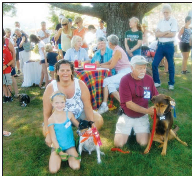
Bark in the Park was a score for Castaway Critters.