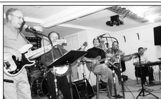
FFA String Band Reunion at Mountain Home Music was a weekend treat for locals.