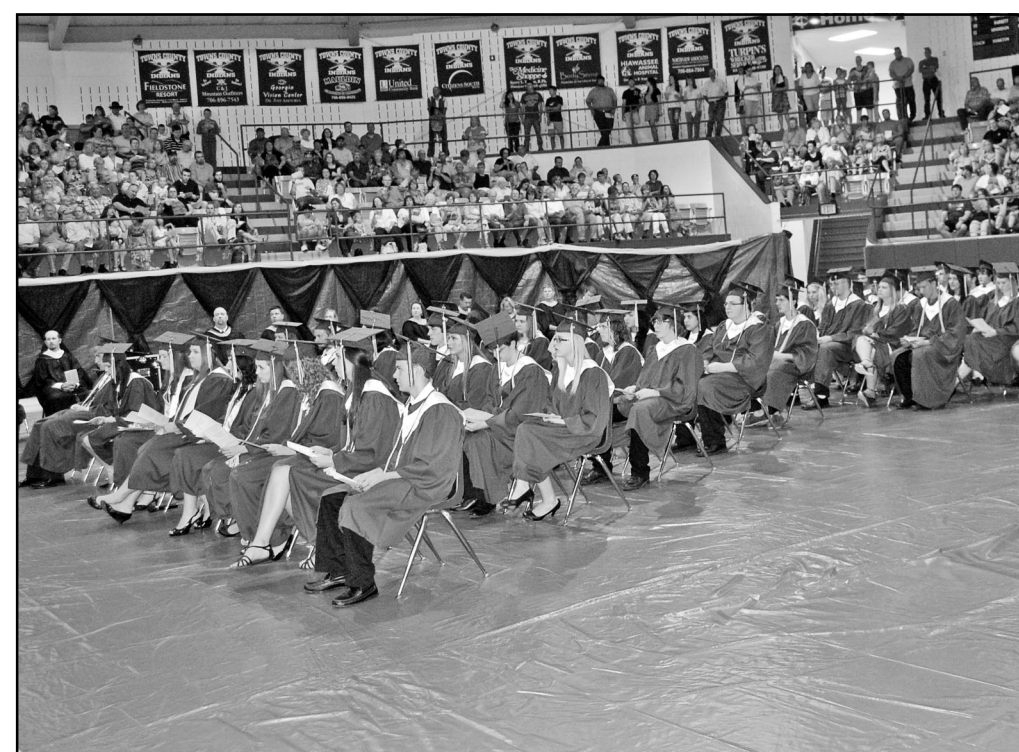
The Class of 2012 in their final moments as seniors on Friday night at Bill P. Kendall Gymnasium in Hiawassee. The Class featured 58 seniors moving into adulthood