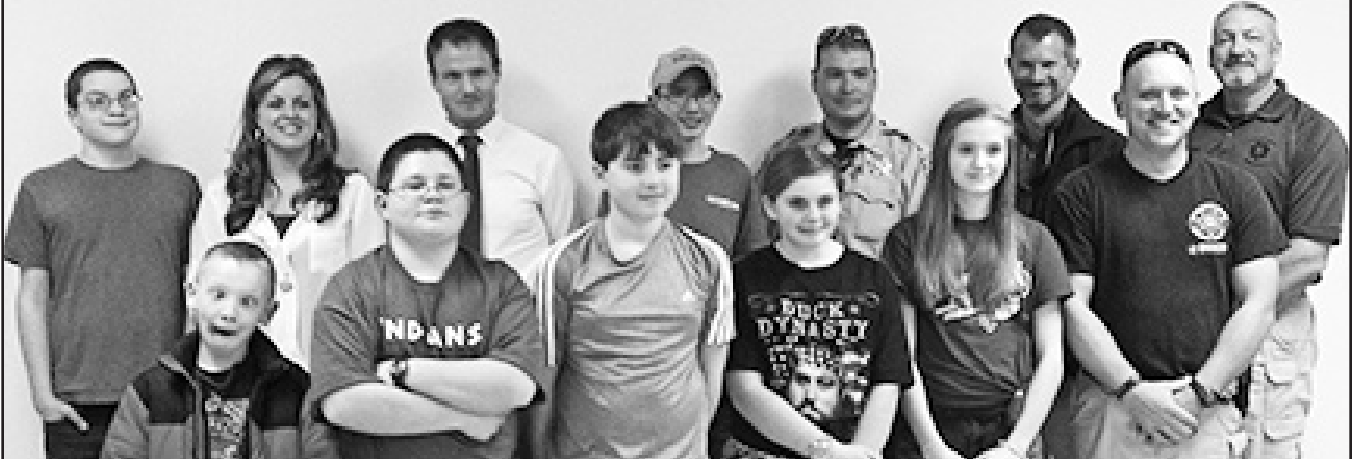
Participants in the 2013 rifle match.

After training and competing among themselves for 10 weeks and competing in a District Qualifying Match, the Towns County 4-H BB Gun kids once again, laid down the gauntlet and challenged the Towns County Sheriff Department to a 4-position rifle match for the cherished 2013 Braggin' Rights.