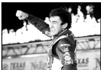
Chase Elliott, Texas Nationwide winner

made in recent years have focused on the cars, beginning with the rollout of the more brand-identifiable Generation-6 vehicle for the 2013 season, and an aerodynamic package that was further refined before this year. This will be the first time the engine displacement size, or the amount of horsepower produced has been lowered.