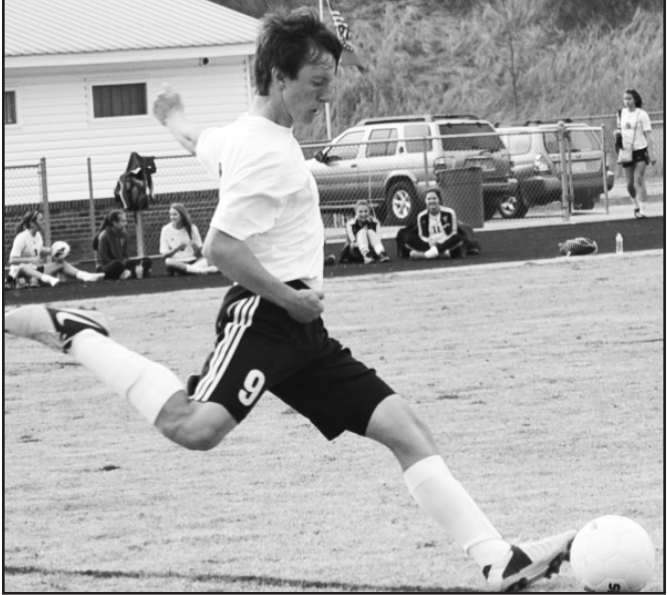
Both Towns Co. soccer teams will have an opportunity to get back on track this week following a pair of one sided losses to Hebron. Towns will host three home games this week.

The Indians, meanwhile, drop to 1-5 but both Towns County squads will get a chance to turn the second half of their