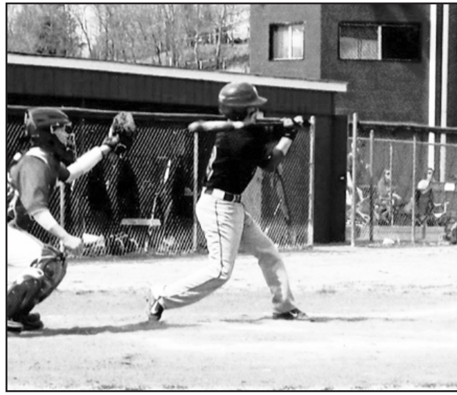
The Towns County JV lineup pounded out 14 runs in its two-game sweep of the Fannin County Rebels earlier this month.