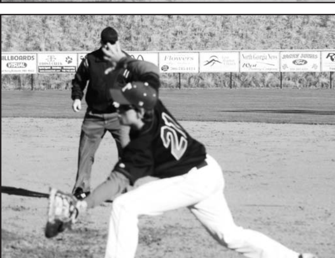
Towns County Indians baseball in action at Union County last week.

He threw a total of 56 pitches with 39 of those pitches finding the strike zone.