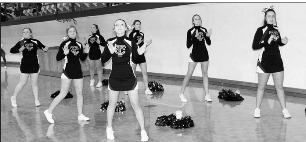
Towns County High School basketball cheerleaders.