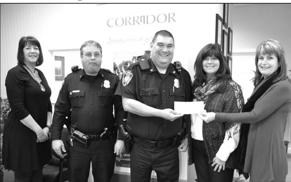
Corridor Mortgage also donated to the Blairsville Police Department's Shop With A Cop program, which took kids shopping on Saturday, Dec. 10

donations to area children's benefits, this year on Monday, Dec. 12: one to the newly christened Shop With A Hero program out of Towns County, and the other to the Blairsville Police Department for their Shop With A Cop program.