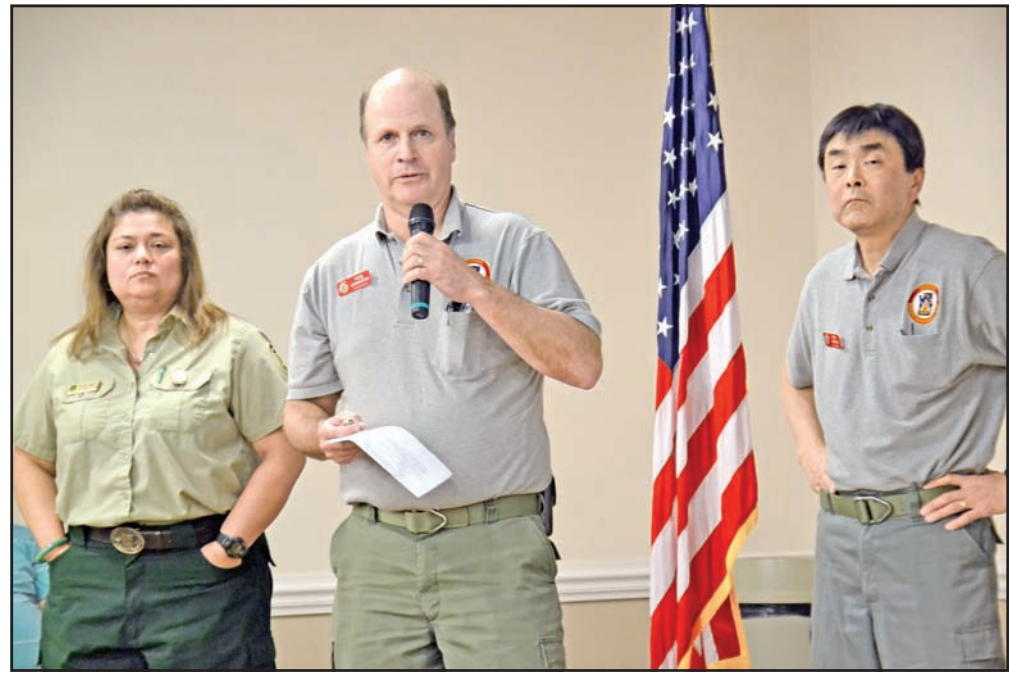
U.S. Forest Service officials shared specifics on the Rock Mountain Fire with county residents on Thursday, Nov. 17