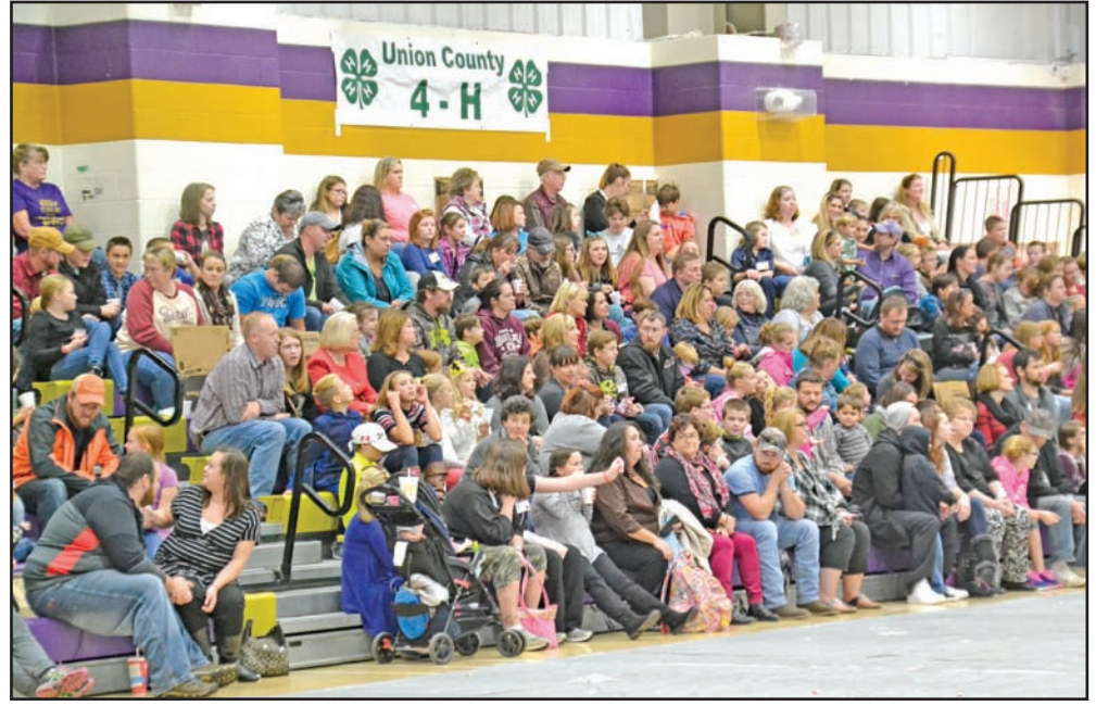
4-H parents turned out in force to help their children represent Towns County at the districtwide speaking contest on Saturday, Nov. 19.