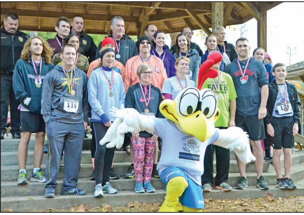
Medal winners from the 5K race

By Todd Forrest Towns County Herald Staff Writer