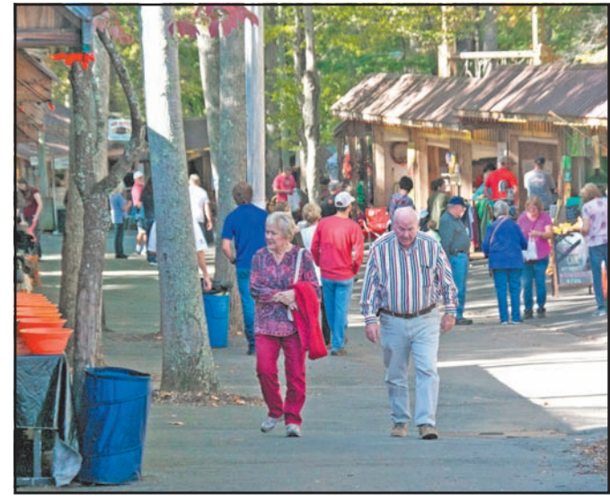
The Georgia Mountain Fall Festival is always sure to draw a crowd.

can purchase them at the gate. It's going to be a really good concert.