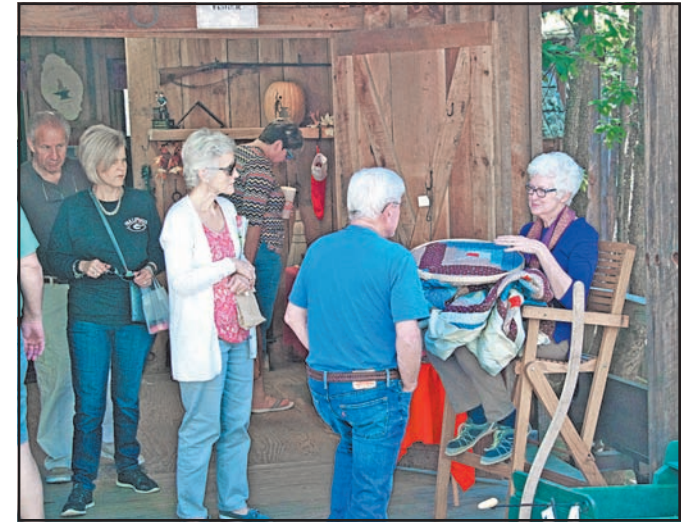
Quilt Makin' is still a popular thing to do in the area, and always in Pioneer Village.