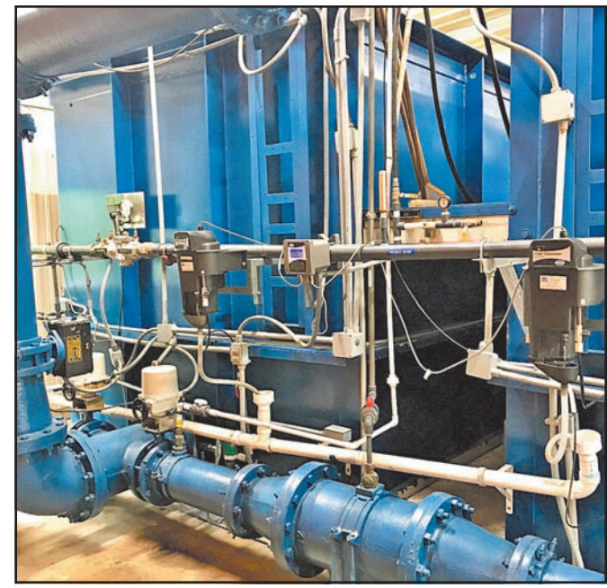
A view of some of the inner workings in the Hiawassee Water Treatment Plant.

There, the water is filtered and treated before heading to homes and