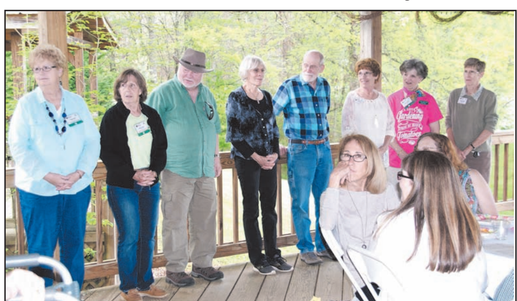
Master Gardener mentors lined up to hand out graduation certificates to their mentees at Crane Creek Vineyards.