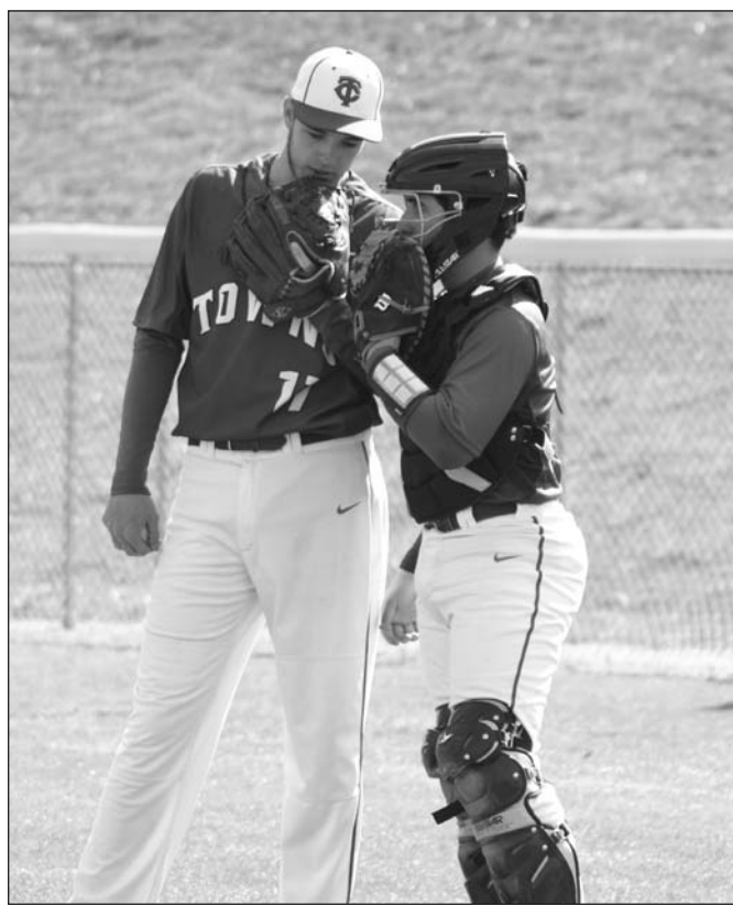
Towns County baseball will return home this Friday to face Commerce in a Region 8-A doubleheader.