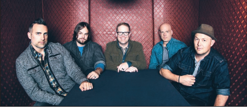
MercyMe is a Contemporary Christian music band that's been around since 1994.