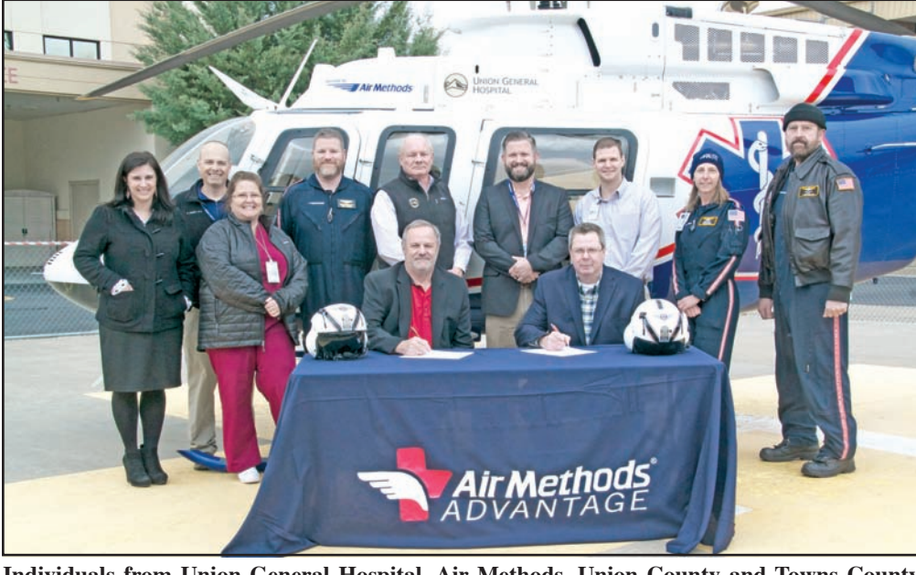
Individuals from Union General Hospital, Air Methods, Union County and Towns County governments, gathered at the UGH helipad on Monday, March 13.

Air Methods is a company that provides air medical transport services to the nearest trauma centers, such as Northeast Georgia Medical