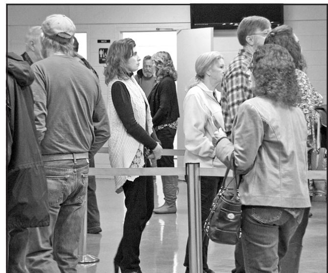
The Hall was packed on Saturday night, as Judd fans poured into Hiawasse to see her fabulous performance.