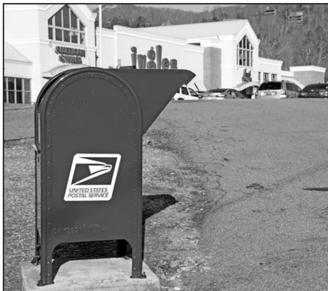
In light of the new one-way designation, the Hiawasse Post Office installed a drive-up mailbox last week for customers who don't want to get out of their cars.