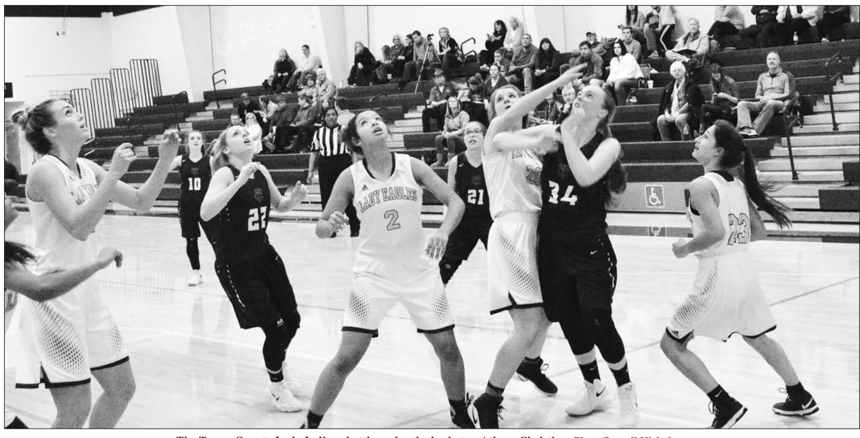
The Towns County Lady Indians battle under the basket vs Athens Christian.