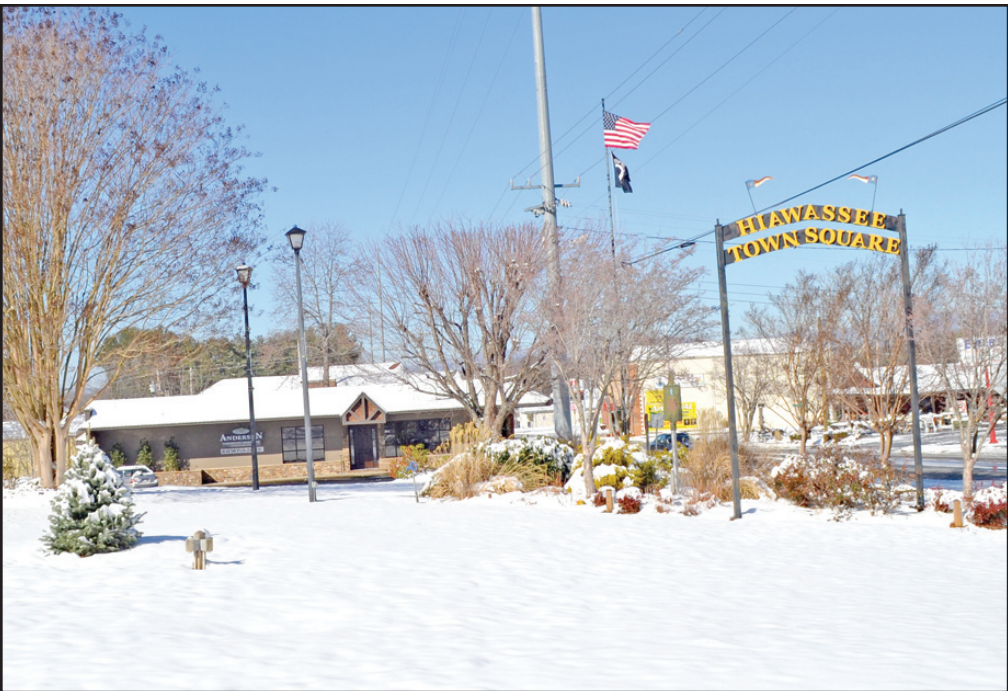
The Hiwassee Town Square covered in snow that fell Jan. 6 and Jan. 7.