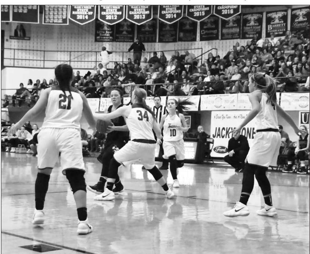
The Lady Indians defense clamps down on the Lady Yellow Jackets during their first round BOTS win.