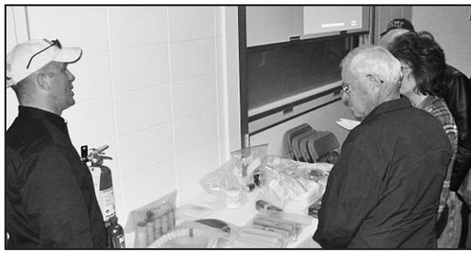
Participants getting hands-on familiarization with military, commercial and improvised explosives.