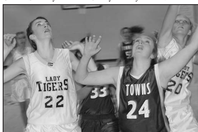
The Lady Indians Junior Varsity girls fight for a rebound against Dawson County on Saturday