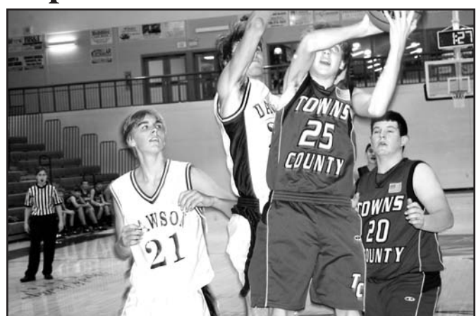
The Indians Junior Varsity boys held their own against Class AA Dawson County on Saturday