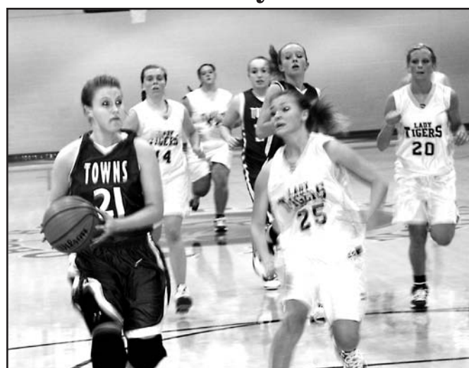
The fastbreak was working for the Lady Indians Junior Varsity Girls on Saturday in Dawson County