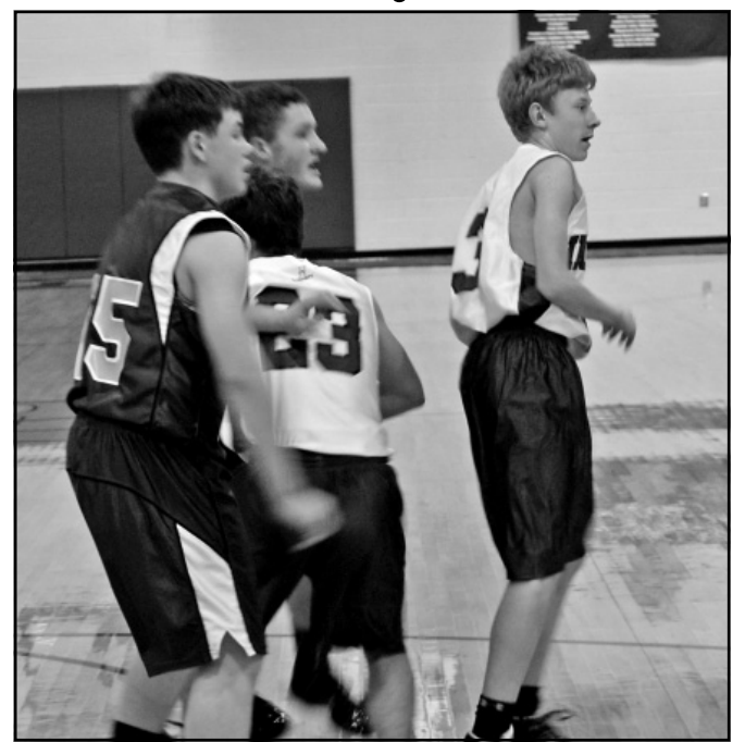
The Indians fought tooth and nail but couldn't buy a basket against Fannin.

"I don't know a whole lot about Lumpkin," he said. "We'll have to wait and see what we're up against on Thursday."