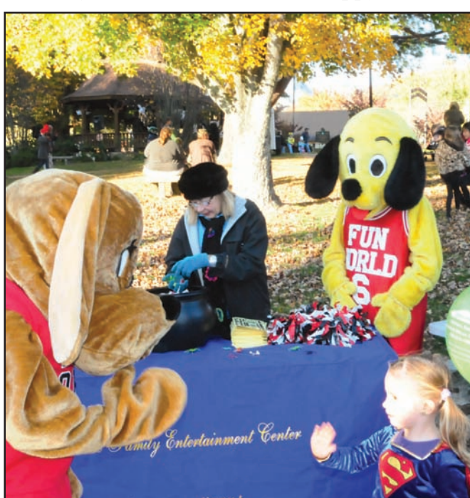
It was a Happy Halloween for this youngster on Saturday in Downtown Hiwassee.