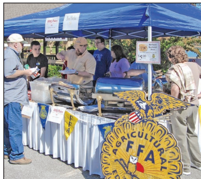
Towns County FFA members hawk Southern barbecue during Sunday's Fall-A-Bration at The Ridges Resort.