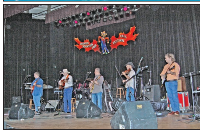
Sharks and music have proved a magic formula of attraction at the Fall Festival at Georgia Mountain Fairgrounds.