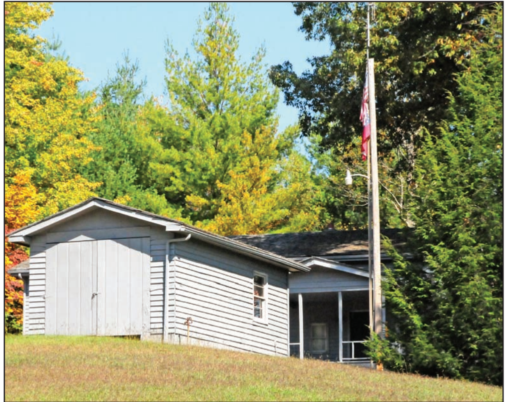
The Georgia Forestry Commission headquarters in Towns County is closed due to state budget cuts, leaving a gaping hole in the local wildfire firefighting scheme. Rangers must now respond from Union County to help fight wildfires in Towns and Fannin counties, according to state and local sources.