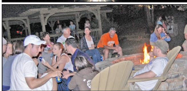
Everyone loves fireworks.