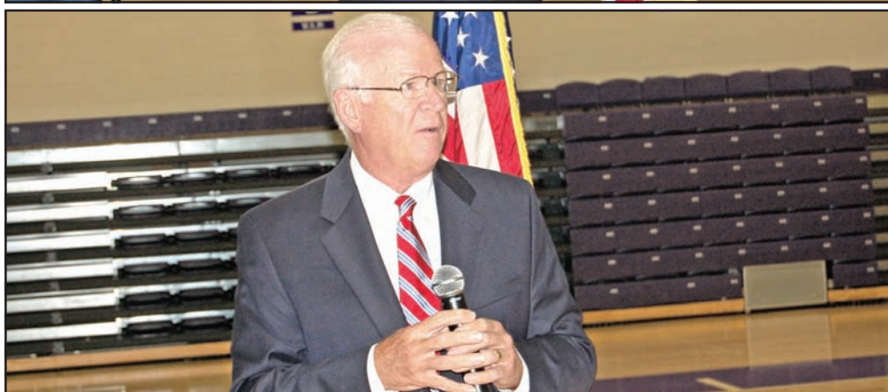
U.S. Senators Johnny Isakson (top) and Saxby Chambliss (below) say Democrats and Republicans must focus on common ground to resolve the nation's financial and economic woes.