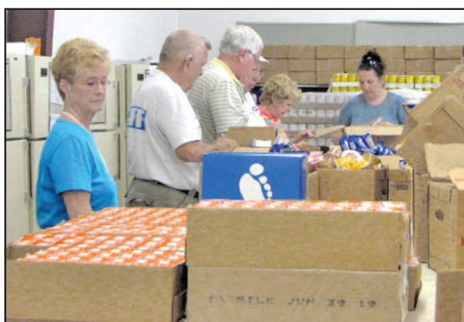
Towns County Food Pantry volunteers fill Back Packs for kids.

The Food Pantry is working with local businesses, Ingles' and Dollar