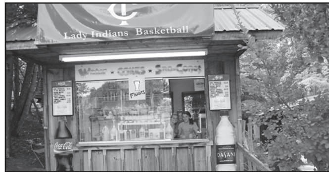
Towns County Lady Indians basketball players in charge of the Beverage Booth