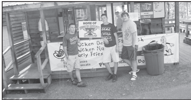
Towns County Indians football players and wrestlers man the Chicken Sandwich Booth