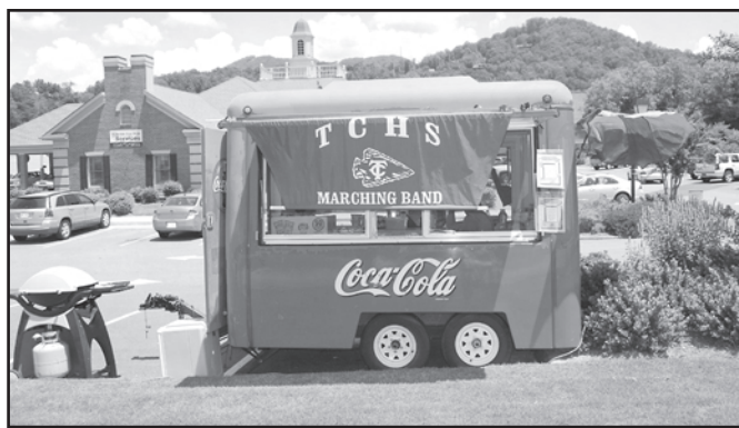
Towns County High School Band members man the Hotdog Booth at United Community Bank