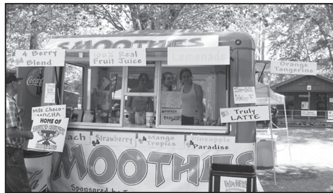
Towns County Fast Pitch Softball players in charge of the Smoothie booth