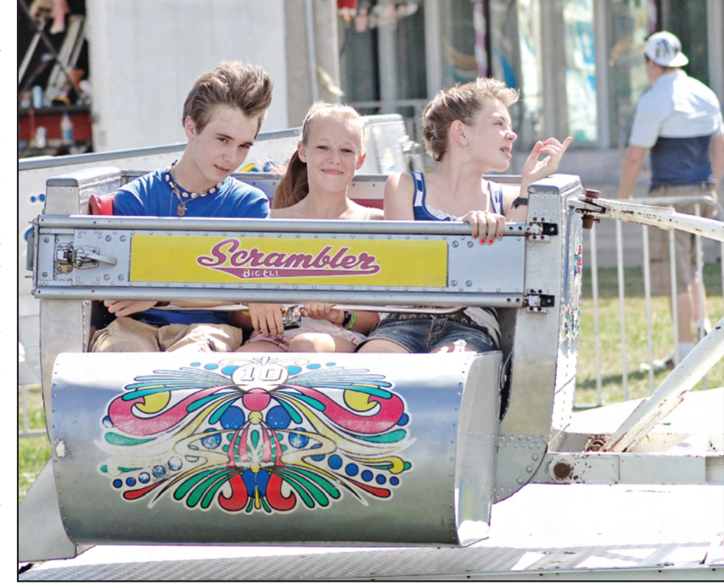
The Scrambler was a popular ride during the first week of the Georgia Mountain Fair held at the Georgia Mountain Fairgrounds in Hiawassee. Large crowds have returned to the Fairgrounds.