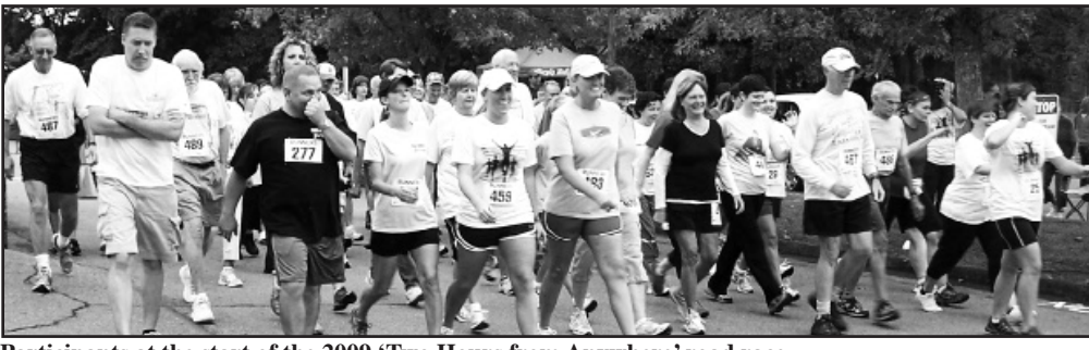
Participants at the start of the 2009 'Two Hours from Anywhere' road race.

Murphy Medical Center Foundation is seeking sponsors for its twentieth annual 'Two Hours from Anywhere' 5K Challenge, two-mile Heart Walk and Kids' Fun Run. The September 18 event is a fundraiser supporting installation of a breast cancer detecting Digital Mammography Imaging System.