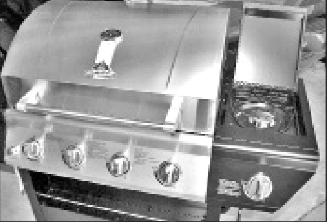
Grill Master donated by Lowes of Murphy