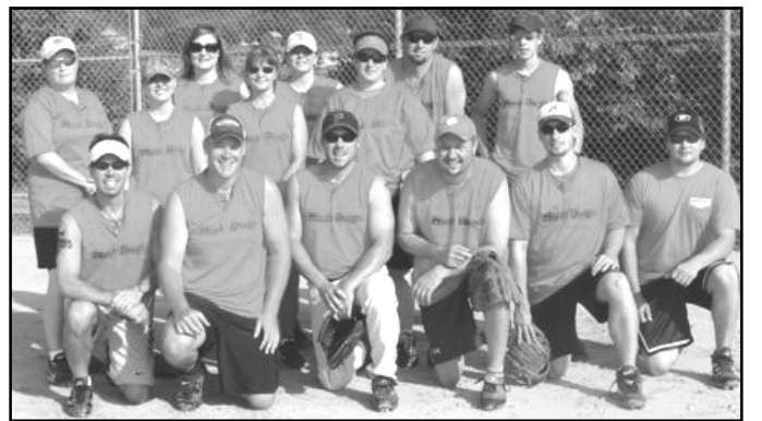
The Towns County Mud Dogs

The games ended at midnight with Franklins Vivid Image, (aka chip n dales) the overall victor. The Northeast Georgia Board of Realtors raised $1,000. for Clay County Communities in Schools. The next tournament will be in Hiawassee on August 15.