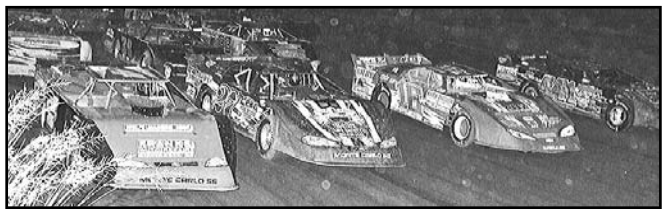
Several of our local drivers are expected in the 20 to 24 cars racing in Saturdays Southeastern Sportsman Series $1,500 to win race.