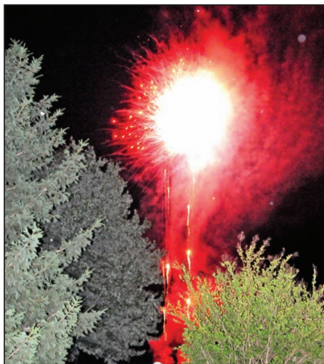
Event goers stared in awe as The Ridges Resort & Marina paid tribute to veterans on Memorial Day Weekend.