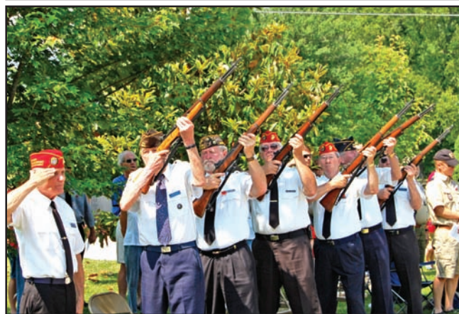
A young scout points to a name on Veterans' Wall and North Georgia Honor Guard provides the Gun Salute on Monday.