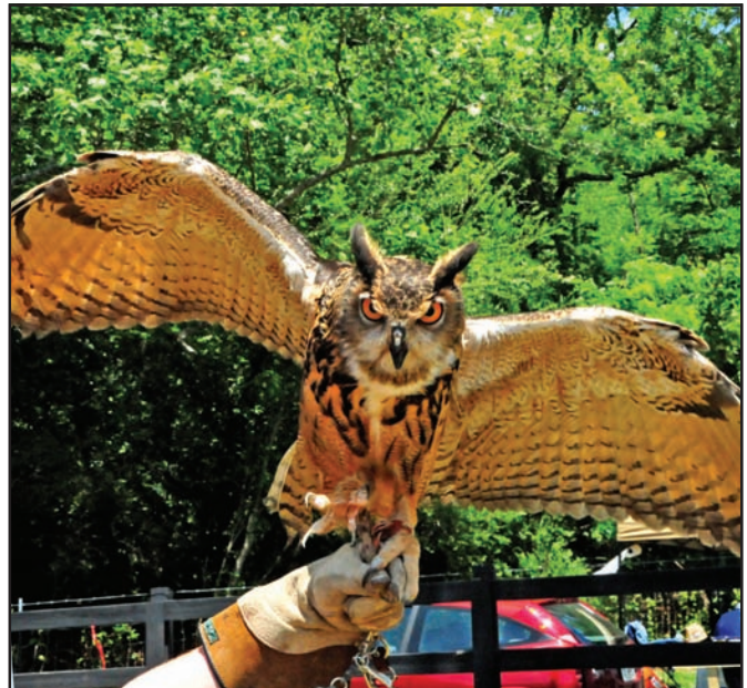
This horned owl was just one of the many Winged Ambassadors at the Annual BBQ Festival at Brasstown Valley.