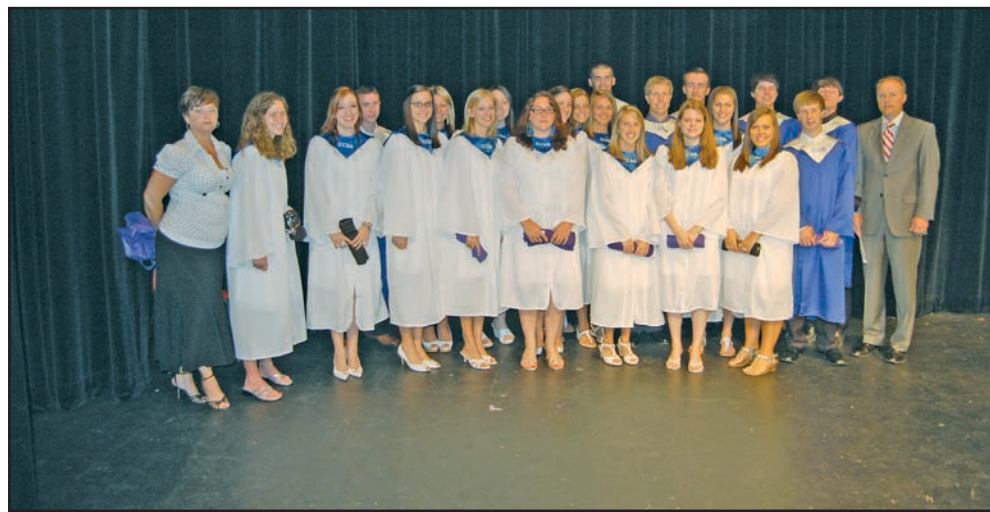
Twenty-one Towns County High School seniors will attend Young Harris College in the fall on scholarships received during the annual Seniors Honors Day at TCHS on Friday.