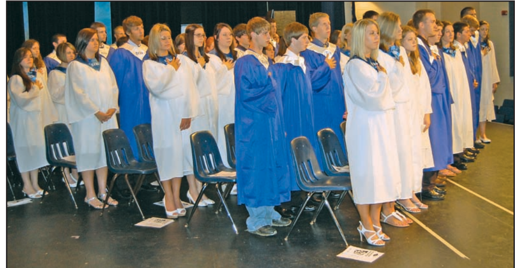
The Class of 2010 recites the Pledge Allegiance during Friday's Honors Day ceremonies in the Towns County Schools Auditorium. The seniors are ready to walk the aisle at 7 p.m. on Friday in the Bill P. Kendall Gymnasium.

"The economy goes up and down," he said.