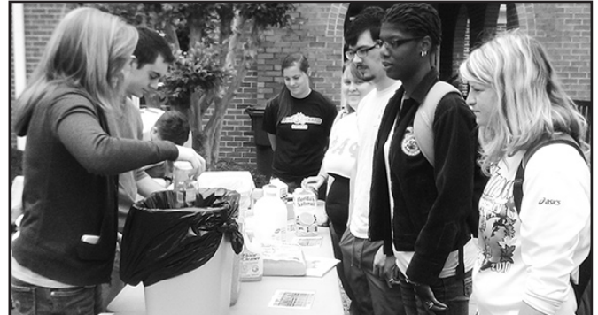
Members of Young Harris College's Student Government Association host a recycling demonstration on the YHC campus.

Young Harris College hosted a special week of service, April 16-23, to celebrate Earth Day, which was Sunday, April 22. The event was co-sponsored by the YHC Sustainability Committee, the YHC Student Government Association (SGA) and Sodexo.