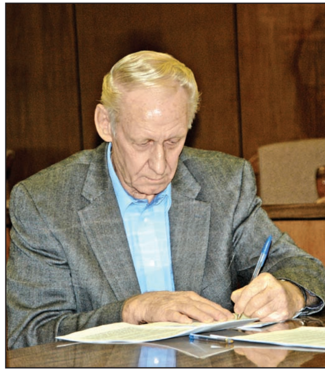
Commissioner Kendall says a confirmed court-ordered consent order lifts sanctions against the county and its cities.

A service delivery strategy agreement allows local governments within the same county borders to receive state and federal