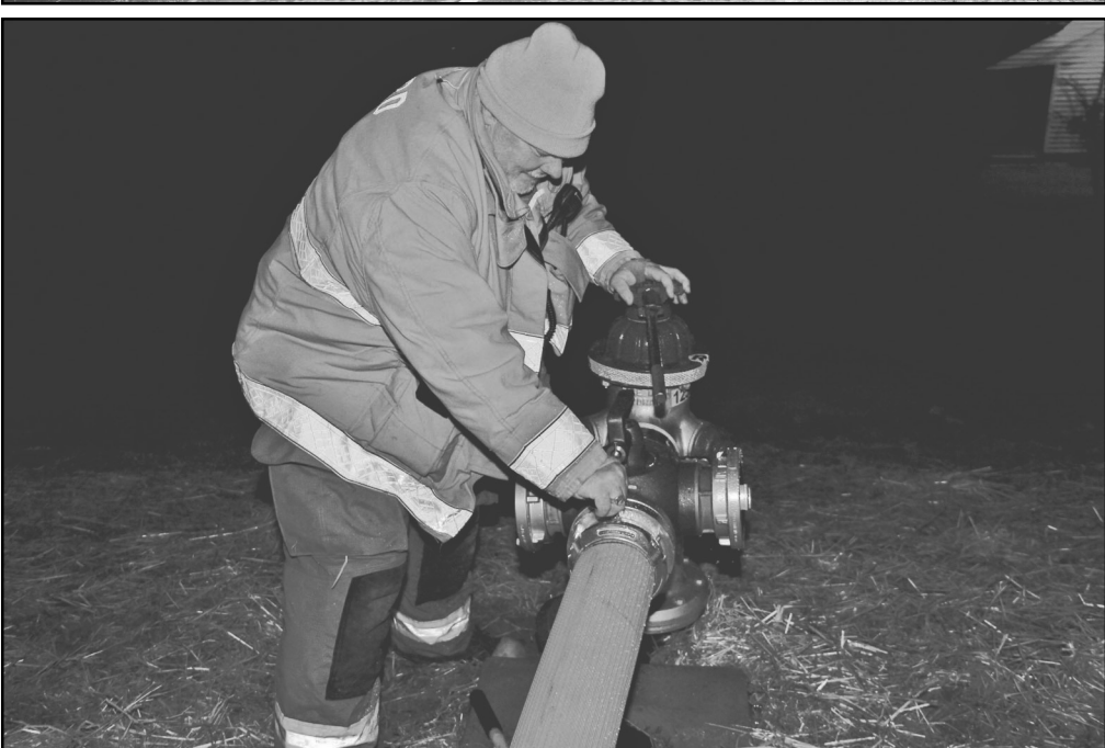
A blaze in the 3000 block of Fodder Creek was quickly doused on Sunday thanks to one of the new fire hydrants installed by the voter-approved Special Purpose Local Option Sales Tax.